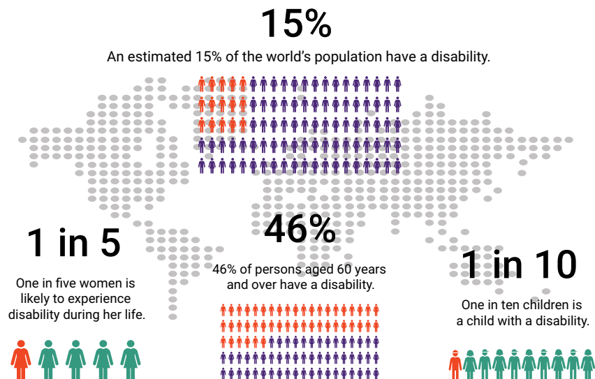
Figure 1 Global population of persons with disabilities (IASC Guidelines, 2019, Inclusion of Persons with Disabilities in Humanitarian Action)